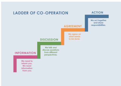
Ladder of co-operation, developed by the project in 2019

The project has, as a supportive tool, developed a ladder of co-operation. The model can aid discussions about the co-operative practices surrounding the child in an asylum and return process. It can help identify and evaluate current practices, explain the need for co-operation, make expectations visible as well as clarify which level of co-operation is necessary.